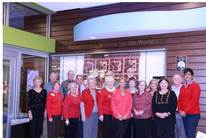
Friends of Evelyn Meador Board of Directors