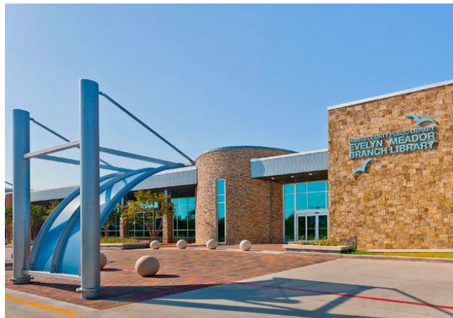
Evelyn Meador Library

Please donate or sign up for membership today! The rewards are many. Seabrook is a vibrant community that thrives on programs that meet a variety of needs. We look forward to your support to help make 2017 an exciting year!